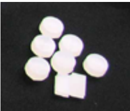
Silicone rubber pads