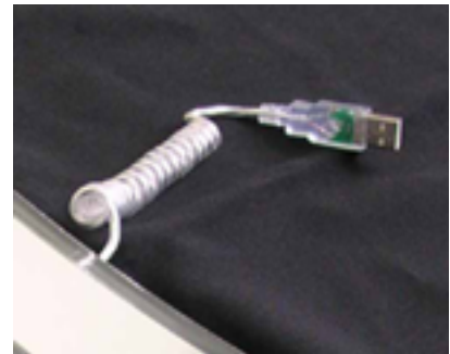
Spring Coiling USB Cable