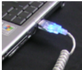
Lighting USB Plug

Xprovider New advance laptop cooling solution, all clear PC made with clear cooling fans and clear cabling as well as light plug.